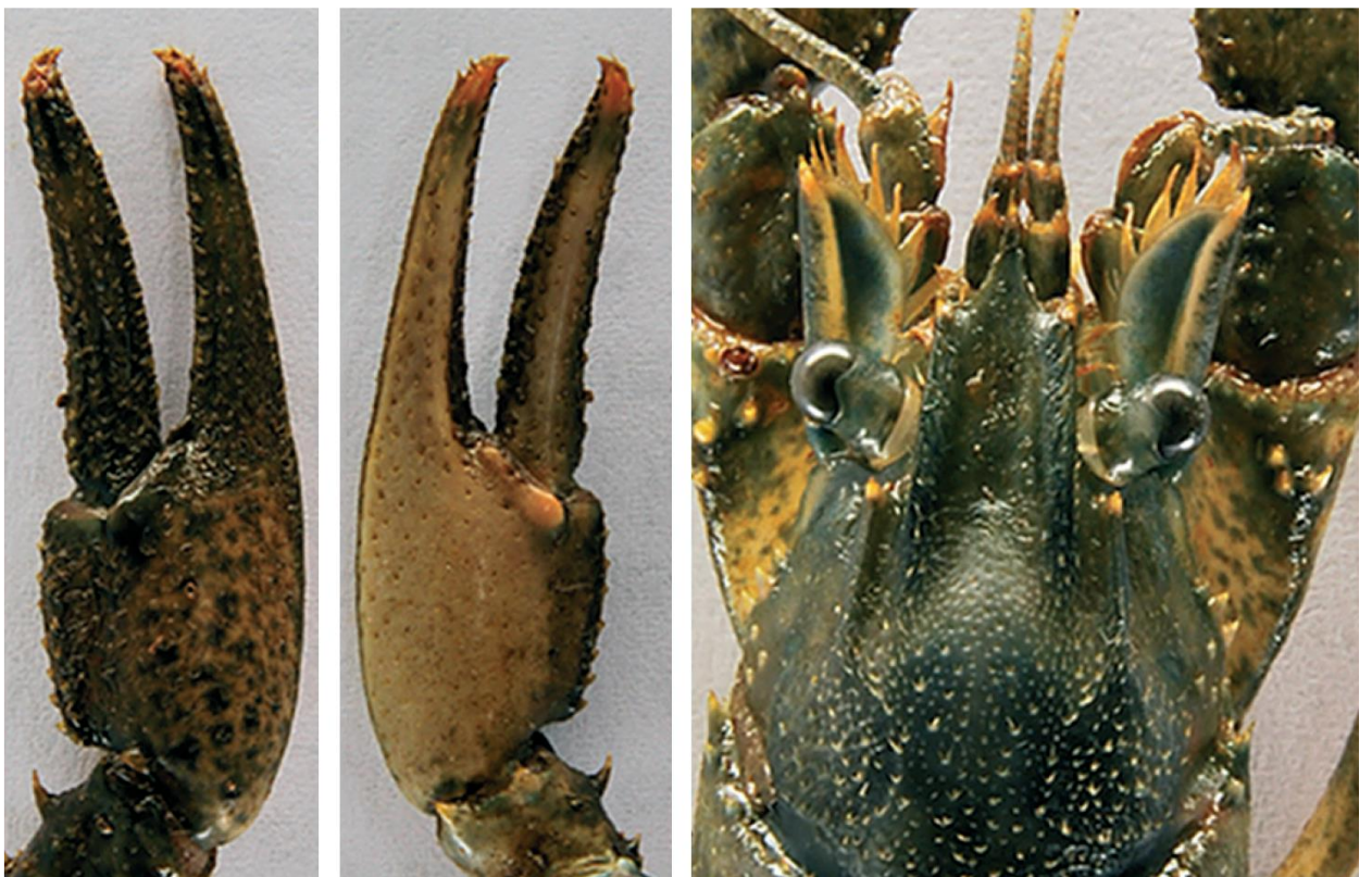
Fig. 2. The detailed view of spiny-cheek crayfish Orconectes limosus chelae from the dorsal (left picture) and ventral side (middle) with apparent orange tips and the cranial part of carapace (right) with visible spines on the sides and on post-orbital ridges (adapted from Kozák et al., 2015).