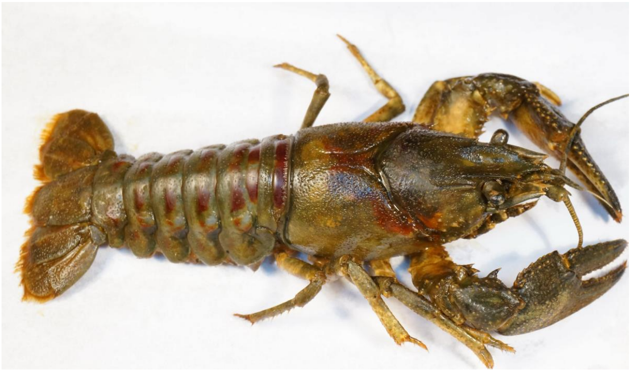
Fig. 1. Spiny-cheek crayfish Orconectes limosus