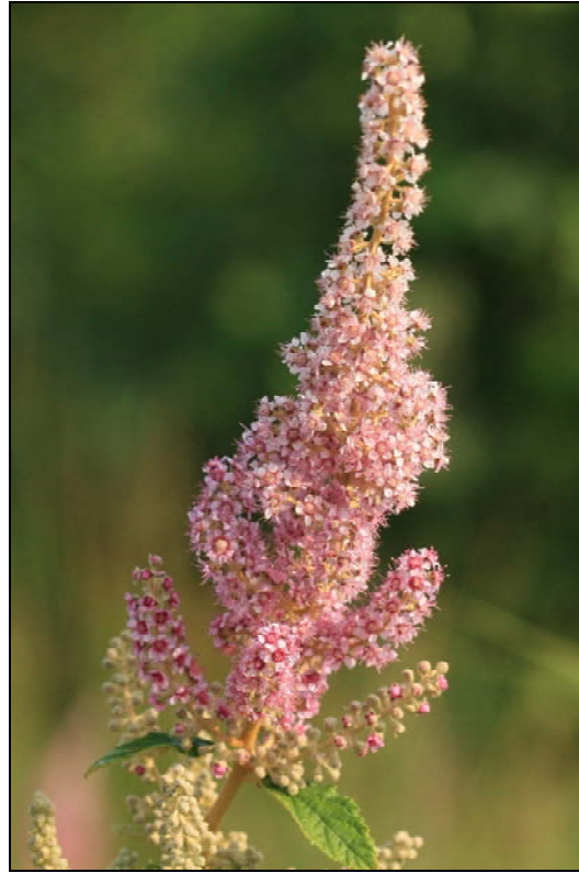
Fig. 1 and 2. Spiraea tomentosa , photos by Zygmunt Dajdok and Waldemar Bena.