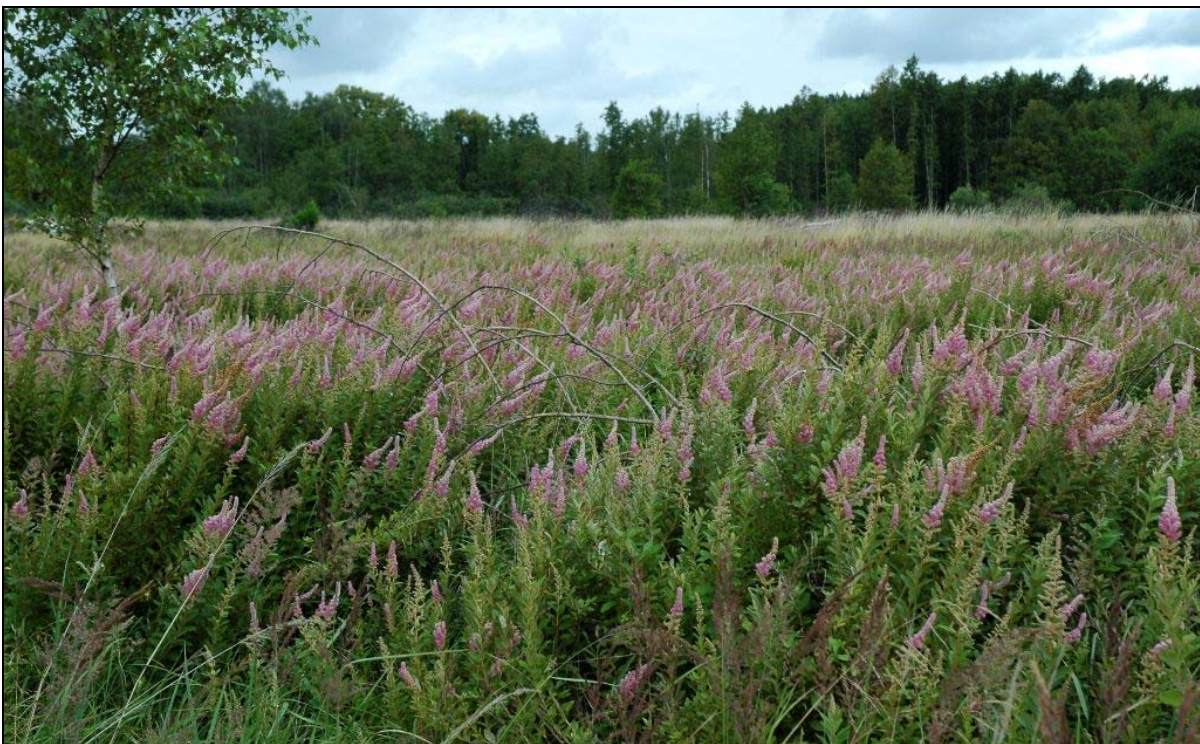
Fig. 4 and 5. Spiraea tomentosa overgrowing ditches and roadsides, and mid-forest meadows in the Lower Silesian forests.

There is a lack of well documented data on the impact of steeplebush on the fauna. However, the transformation of wet meadows or open peatbogs into solid and hardly accessible steeplebush “thicket” has, within only a dozen years, essentially changed the living conditions of many species, including those of the minor animals. Even for large mammals, such as wild pig Sus scrofa or red deer Cervus elaphus , this brushwood is an ideal refuge.